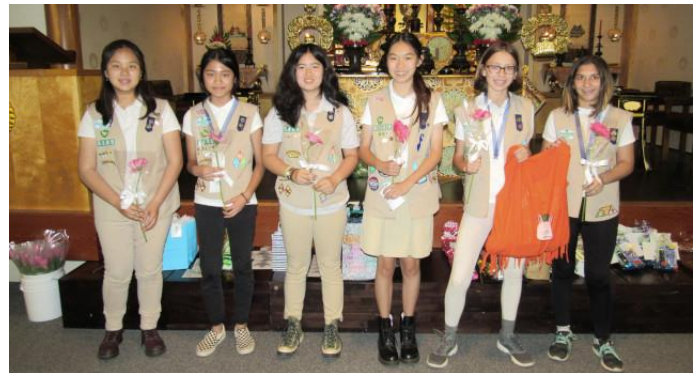
Silver Award Recipients