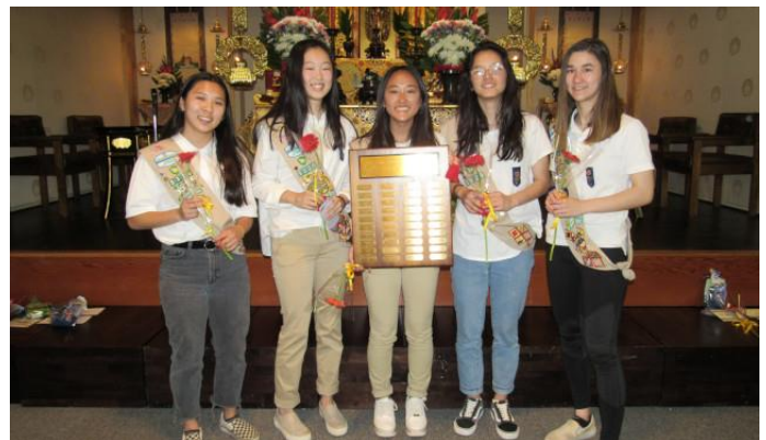
Gold Award Recipients