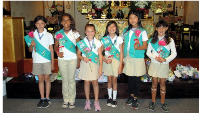
Bronze Award Recipients